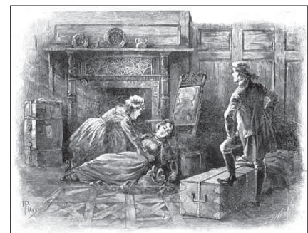
Illustration from "The Forsaken Inn'